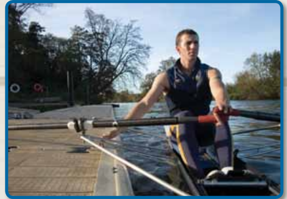
Low profile and freeboard height for easy access in and out of the water

EZ Dock makes a perfect platform for launching rowing shells. The unmatched stability and flotation capacity allows for even the largest 8 person crews to safely and confidently carry their shells to the dock edge for launching. Dock freeboard can be adjusted to the optimum level by adding or removing water ballast from the dock sections as needed.